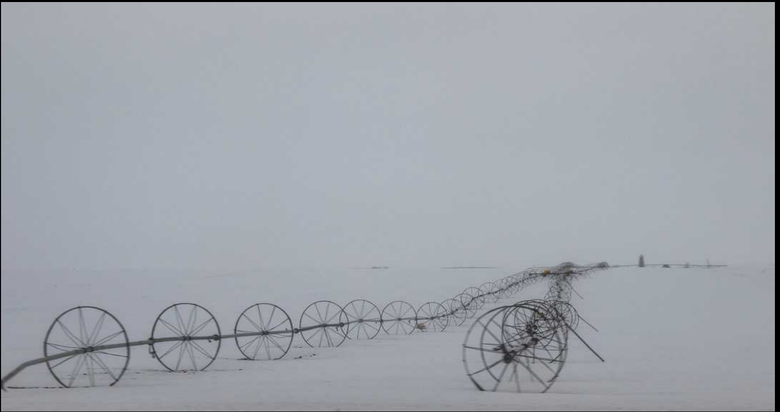
“FROZEN FIELDS” by Carrie Topliffe