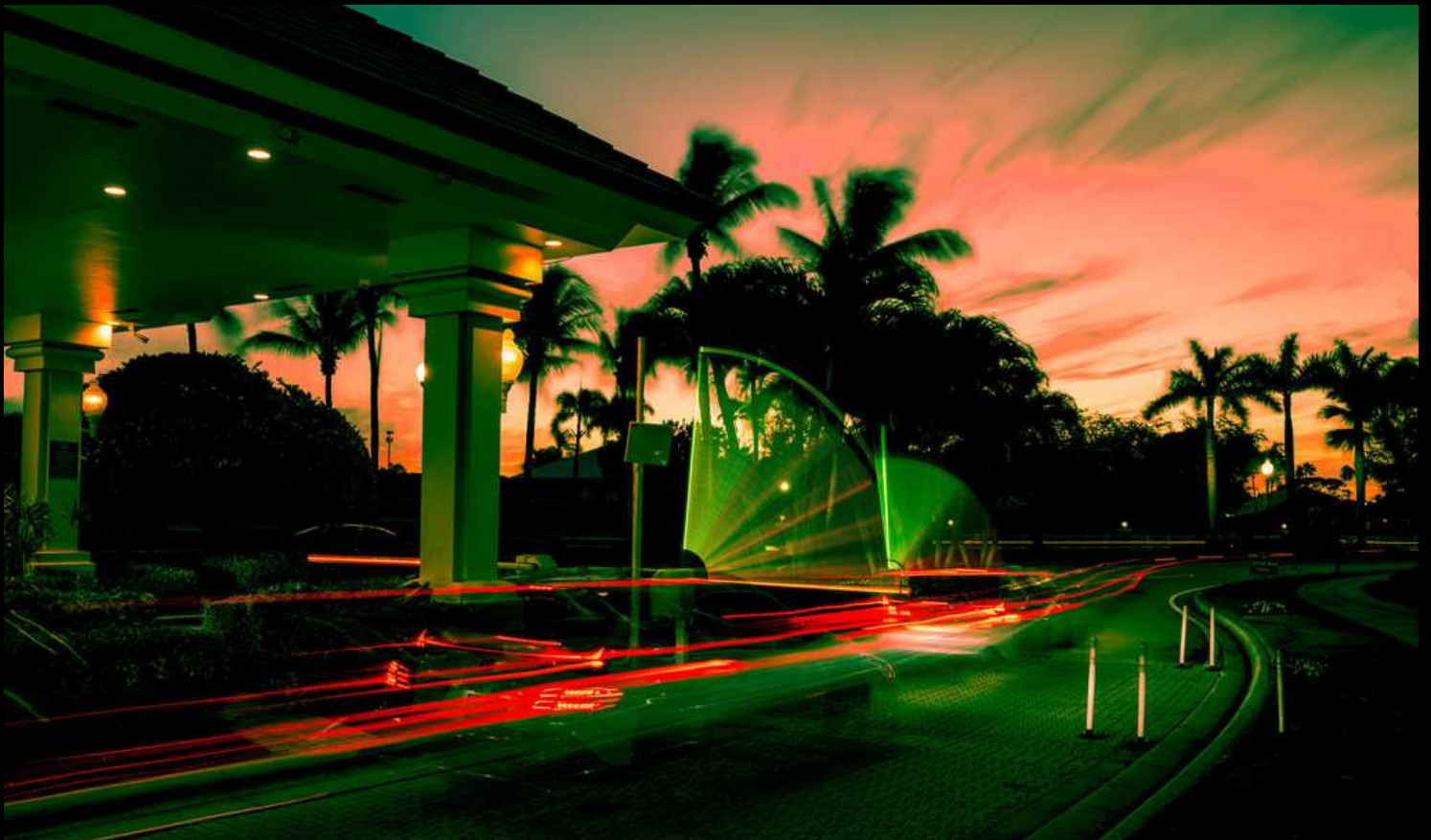
“COMMUNITY GATE” by Ron Abeles