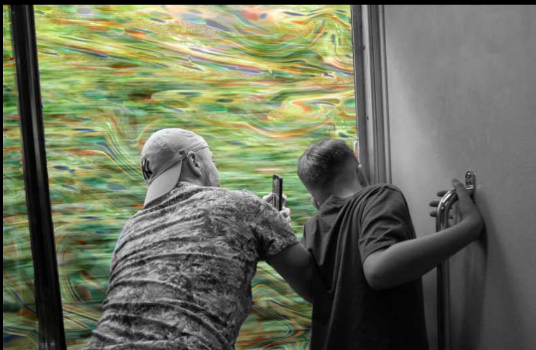
“TRAVELING WITH DAD” by Carrie Topliffe