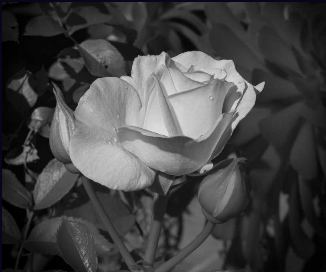
"ROSE" by Pat Birdsell