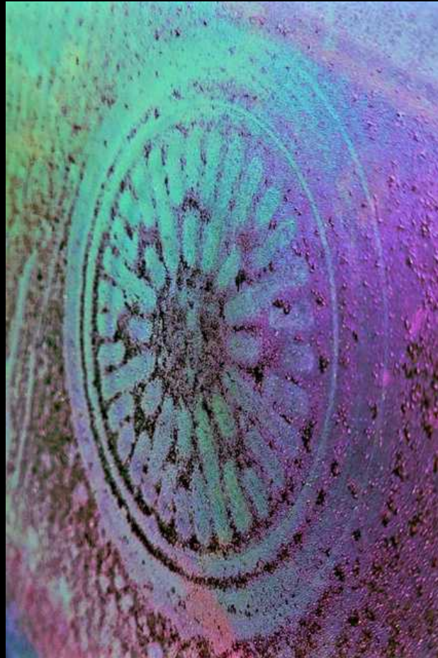
"COLOR WHEEL" by Cena Kregel