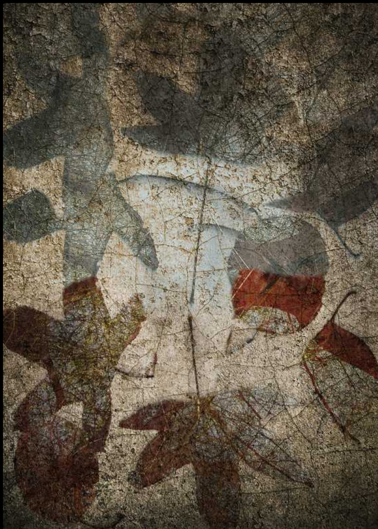
“LEAF DECAY” by Zoltan Puskas