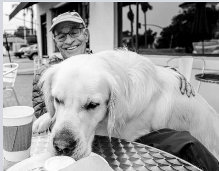
by Glen Serbin