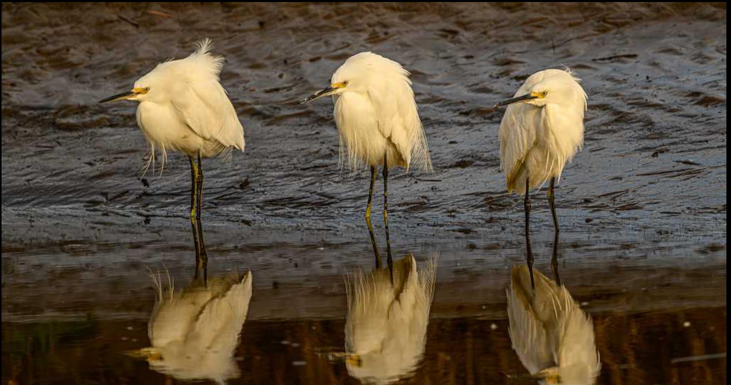
"THREE EGRETS" by Ed Northup