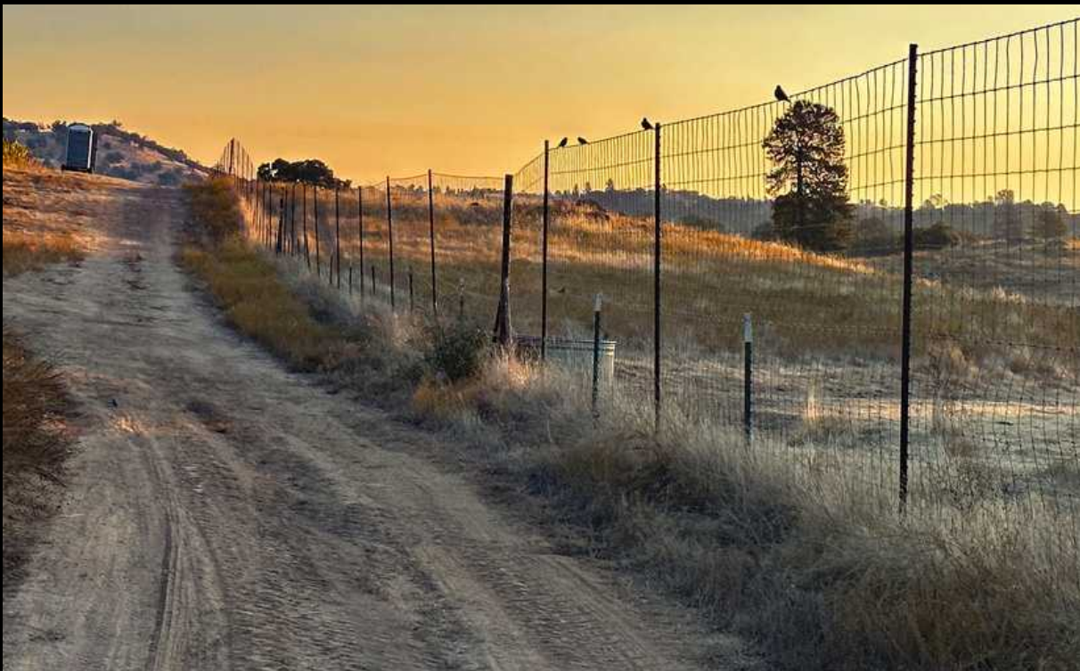
"Morning" by Ellen Clark Return to Table of Contents