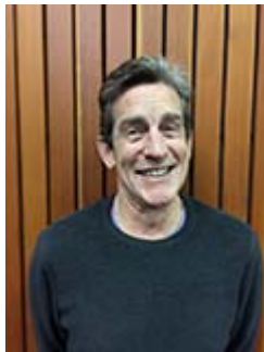
Print Exhibition Brian Woolford