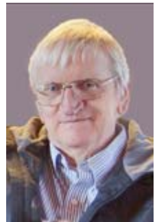
Equipment Walter Naumann