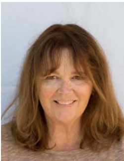
Projected Images Chris Seaton