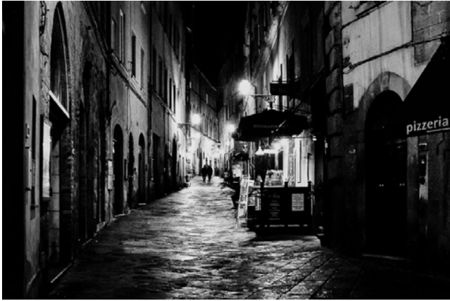
"One Night in Volterra" - Bill Banning (score = 20)